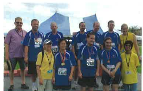
The Gimbel Reilly Guerin & Brown team with Special Olympics of Wisconsin.